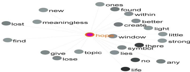
Figure 5. Visual mapping of the ‘hope’ collocates in LLC- as produced by GraphColl tool in LancsBox (Brezina et al. 2021)

Similarly, ‘hope’ collocates did not map a clear thematic extrapolation (see Figure 5). Still, one strong collocate of ‘hope’ is ‘life’- as already discussed under ‘life’ (see Figure 3). Interestingly, across all the themes highlighted in Table 5, ‘hope’ and ‘life’ are the only two themes that collocate strongly.