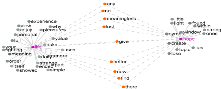
Figure 6. 2 nd order visual collocational network for ‘life’ and ‘hope’, as produced by GraphColl in LancsBox (Brezina et al. 2021)

To explore further this collocational relationship between ‘life’ and ‘hope’, a 2 nd order as coined in Berzina (2018) network for ‘life’ and ‘hope’ was mapped (see Figure 6).