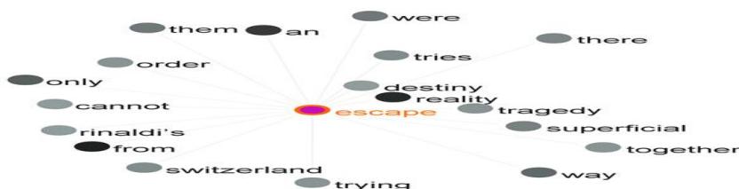
Figure 7. Visual mapping of the ‘escape’ collocates in LLC- as produced by GraphColl in LancsBox (Brezina et al. 2021)

Last but not least, the ‘escape’ collocates imply a possible thematic extrapolation as shown in Figure 7. The meshing of ‘escape’ collocates exposed an interpretation of ‘escape’ as a theme along a continuum of (1) ‘reality’ and ‘superficial[ity]’, and (2) ‘destiny’ and ‘tragedy’.